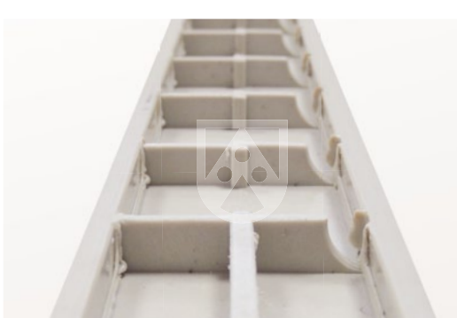
Standard equipment: Recess for leakage monitoring