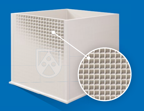
Fast production: Rectangular tanks made from Polystone® P CubX®

The tank construction sheet Polystone® CubX® featuring a unique inner cube structure for outstanding stiffness properties. Potential steel reinforcement reductions of up to 100%. The time saving in tank construction is enormous.