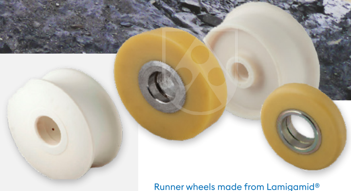
Runner wheels made from Lamigamid®

The Lamigamid® runner wheels have been used successfully for decades in hoists and transport systems. Thereby the plastic product meets the general requirements for running wheels much more than comparable steel wheels. The more elastic and therefore more flexible material has a gentle effect not only on the bearing but also on the rail or rope and thus the service life time of the system.