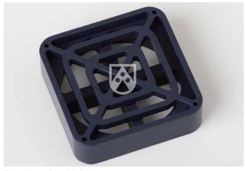
Fibracon® Detectaflon machined part