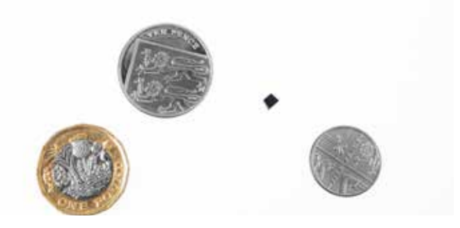
The material can be detected in sizes as small as 2mm<sup>3</sup>

The materials have been manufactured in accordance with the rules for GMP. EC/2023/2006, and there is a traceability system according to EC/1935/2004. The polymer is certified to EU 10/2011. The final product or articles should be tested for