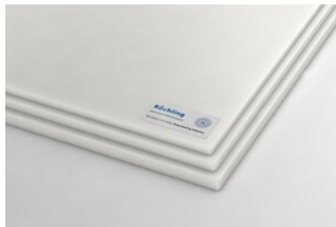
Polystone® PVDF HG natural

For more information about technical data, product handling, certifications, compliance or delivery program scan the QR-Code and visit our website or talk to our experts.