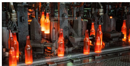
Gripper for glass bottles