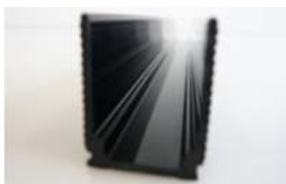
U-profile made of SUSTAPEEK