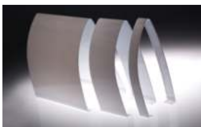
Optical warning system made of SUSTANAT® PC