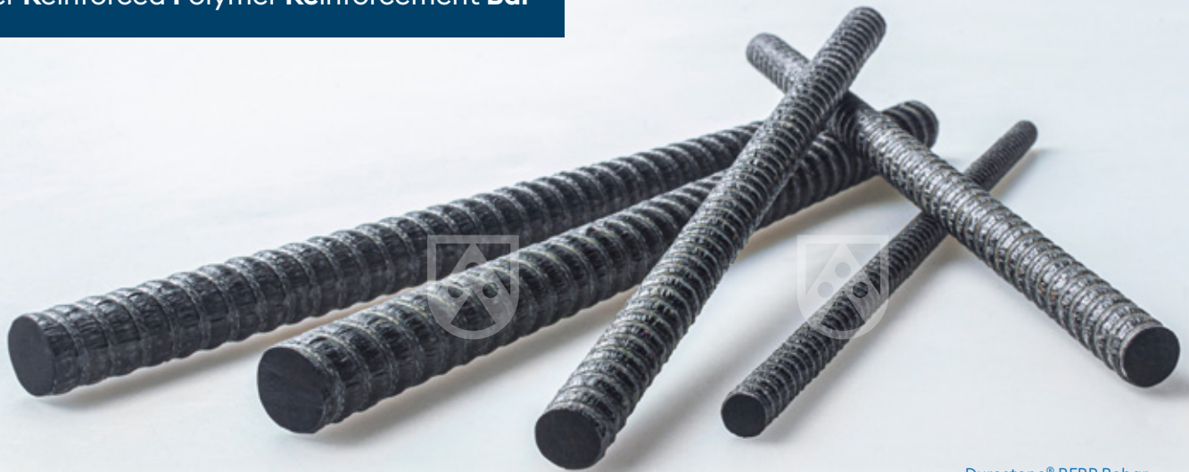
Durostone® BFRP Rebar

FRP REBAR Fiber Reinforced Polymer Reinforcement Bar